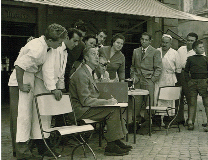
The motorbike picture could be anywhere. The one above looks like Barcelona or Rome. These are probably some of the people who were looking forward to being in an ad that Norman mentioned having to avoid in the future. All except the fellow sitting down. That looks like my dad.