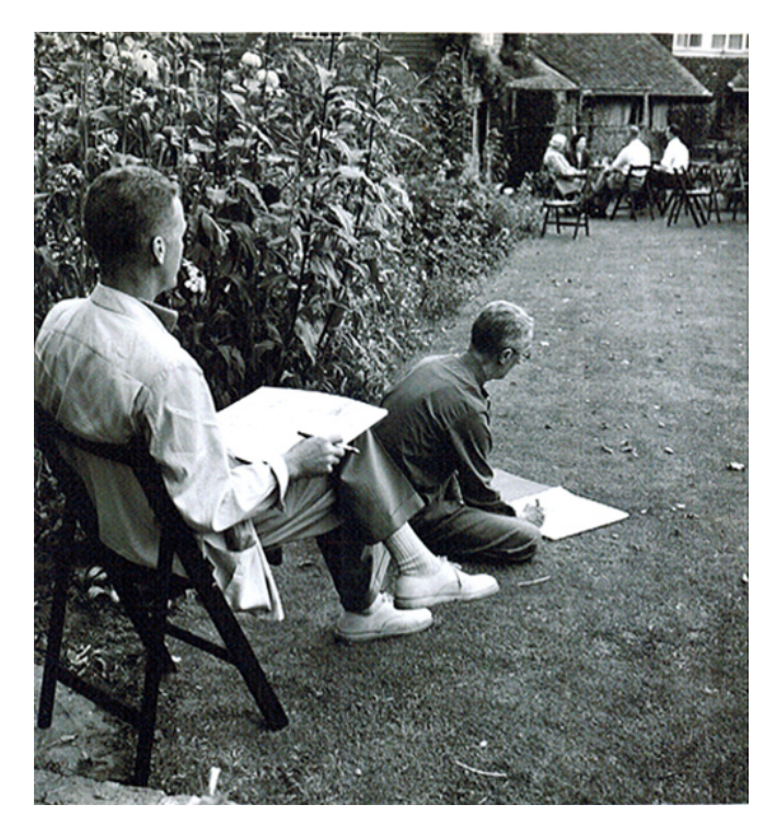
Sketching afternoon English tea. To the right, colleague is shown where to place his feet. Wouldn't be surprised if they're near the banks of the Seine.